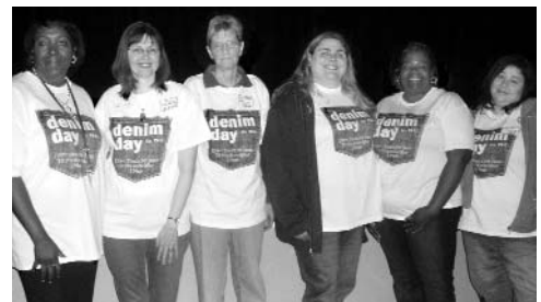
Above: Rape Crisis Center staff educates teens on Denim Day about the importance of consent in preventing sexual violence.