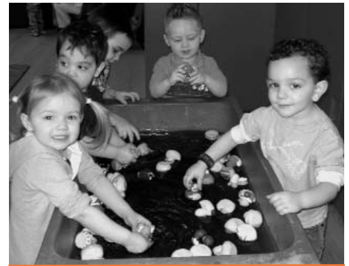
Preschool children at the YWCA Early Learning Center celebrated spring with "Ducky Day."

Working parents in Bergen County were hit hard by the recession, and looked to our YWCA to continue to offer them the assurance of affordable, quality child care. Responding to the changing needs for child care in this economy, the YWCA successfully merged our Valley Hospital Corporate Child Care Center in Ridgewood with our YWCA Early Learning Center, Margaret Rodie Campus, in Upper Saddle River in September 2009. As a result, we are providing more families with access to the enrichment programs and flexible scheduling options available at the Rodie Center's state-of-the-art facility. We continued to provide before/after school care to more than 1,200 children at 26 sites throughout the county, and responded to the increased demand for child care scholarships by controlling costs and providing $60,290 in financial assistance to families in need. This included helping 28 children enjoy a summer camp experience their parents could not otherwise have afforded. We also launched our Girl Power Camp, where 11-to-14-year-olds enjoyed a mix of traditional activities and self-esteem building programs in an empowering "girls-only" environment.