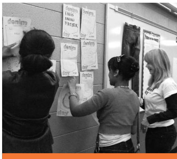
Students at Teaneck High School posted pledges about consent and healthy relationships as part of Denim Day in NJ 2010.

YWCA Bergen County has been operating the county's only 24/7 Rape Crisis Center and hotline since 1979. Providing support and advocacy services for survivors of sexual violence and their significant others has long been the center's primary mission; but with the continued growth of sexual violence as a serious public health issue, we have committed new resources to prevention. On April 28, 2010, the YWCA succeeded in its year-long effort to adopt Denim Day as an official statewide observance in New Jersey. An international observance focused on the prevention of sexual violence, Denim Day was launched in New Jersey in 2008 by our YWCA as an opportunity to educate high school students about consent and healthy relationships. This year's observance included a public ceremony honoring the local legislators and supporters who were instrumental in the passage of the resolution. In addition, the YWCA is leading the efforts of the Coalition for Sexual Assault Free Environment (S.A.F.E.) to prevent sexual violence before it occurs. With funding received from the NJ Division on Women, the coalition has conducted a needs assessment and chosen the Green Dot program as its strategy to prevent sexual violence by engaging bystanders. Beginning with implementing the Green Dot program on college campuses across the county, we hope to one day create an environment free from all forms of power-based personal violence.