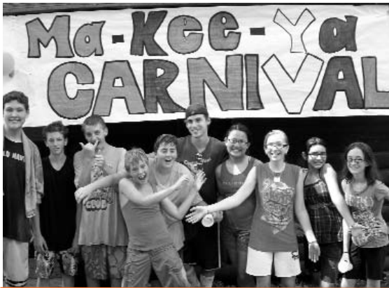
Campers and counselors had plenty to cheer about during Carnival Day at the YWCA's day/residence Camp Ma-Kee-Ya in Harriman, NY.