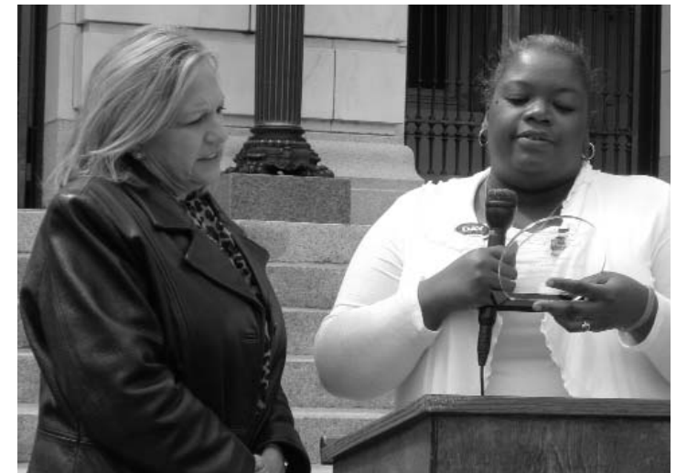
L to R: New Jersey Assemblywoman Valerie Vainieri-Huttelle accepts a commemorative Denim Day plaque from YWCA Rape Crisis Center advocate Angelae Wilkerson during a recognition ceremony at the Bergen County Justice Center.

This spring the YWCA Rape Crisis Center celebrated the first official statewide observance of Denim Day in NJ. Denim Day is an international observance focused on the prevention of sexual violence. It was launched in New Jersey in 2008 by the YW Rape Crisis Center, which spearheaded efforts to adopt it as an annual statewide observance. On April 28th, local legislators and supporters who were instrumental in the passage of the resolution were honored during a public ceremony at the Bergen County Justice Center. The center's staff also partnered with high schools in Teaneck, Hackensack, Lyndhurst, and Tenafly to facilitate Denim Day education programs for students.