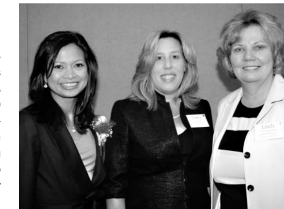
Celebrating 35 years of workplace empowerment at TWIN 2009

As the YWCA Bergen County’s Tribute to Women and Industry (TWIN) awards celebrated its 35th anniversary on April 30th, 2009, it was clear that honoring the accomplishments of professional women—and the staying power of businesses like our sponsors—is as important today as it was when TWIN was established in 1974. The 30 women and 20 companies that received the TWIN Diamond this year are shining examples of the significant role that courage, leadership, and wisdom play in excelling in challenging times. The YWCA was proud to partner with host company, Unilever, which recognizes that creating a diverse work environment that respects, values, and celebrates differences is critical to business success. To them, and to all of our TWIN corporate sponsors, we express our sincere gratitude for their generosity. Our mission lives on through their support.