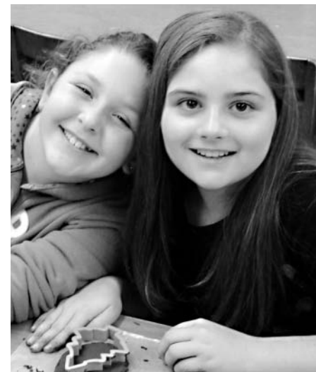
Making friends in a River Vale After School program

This year our YWCA continued its efforts to expand the reach of its child care services and to ensure that they are affordable to Bergen County families. Given the extraordinary economic circumstances, this was no easy task. As demand for financial assistance grew, funding for scholarships decreased. However, we increased the number of sites where we provide before/after school care from 24 to 26. By keeping costs low and providing financial assistance to needy families, our YW helped make summer camp a reality for 13 families (18 children) who could not otherwise have afforded it. And as we prepared to launch our new “Girl Power Camp” (which debuted in July 2009), we were able to offer $4,560 in scholarships so that 11-to-14-year-old girls could enjoy this unique, self-esteem building experience.