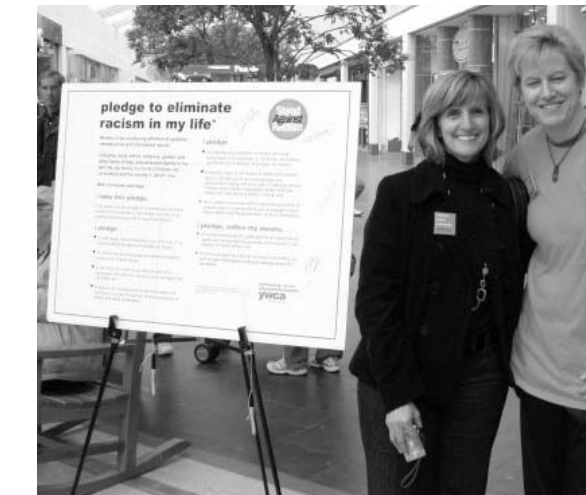
Taking a Stand Against Racism in Paramus Park Mall

For example, we and our YWCA sisters across the country cheered on January 29th, 2009 as President Obama signed his first major piece of legislation: the Lilly Ledbetter Fair Pay Act. The YWCA lent its collective voice to Ms. Ledbetter’s victorious fight to convince Congress to counteract a Supreme Court ruling that required employees to file pay discrimination claims within 180 days of receiving the first discriminatory paycheck. The resulting law enables individuals to challenge ongoing pay discrimination and protects employees from workplace discrimination. On April 3rd, 2009, we built on the work our YW has done to promote increased racial understanding from within our organization and took our mission to the streets, hosting a community-wide Stand Against Racism. A regional YWCA initiative aimed at raising awareness about discrimination and celebrating diversity, the Stand Against Racism was launched in 2008 by the YWCA’s of Trenton and Princeton. This year, our YW was joined by close to 20 businesses and organizations plus local legislators, community activists, students, and area residents for an event that was the first of its kind in Bergen County—and which promises to be the first of many.